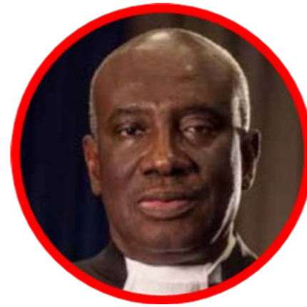
Hon. Hassan BUBACAR JALLOW Chief Justice of Gambia and former Prosecutor of the International Criminal Tribunal for Rwanda (ICTR)