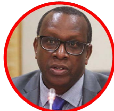
Dr. Jean Damascène BIZIMANA Ministry of National Unity and Civic Engagement