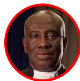
Hon. Hassan BUBACAR JALLOW Chief Justice of Gambia and former Prosecutor of the International Criminal Tribunal for Rwanda (ICTR)