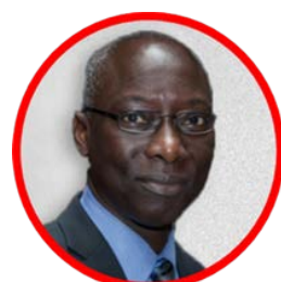
M. Adama DIENG Former Chief Registrar of the ICTR / Special Adviser to the UN Secretary-General on the Prevention of Genocide