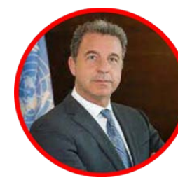
Hon. Serge BRAMMERTZ Chief Prosecutor of the International Residual Mechanism for Criminal Tribunals (IRMCT)