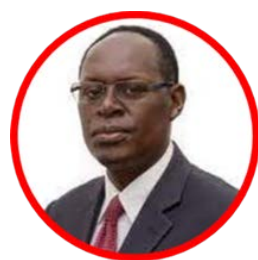
Hon. Faustin NTEZILYAYO Chief Justice of Rwanda